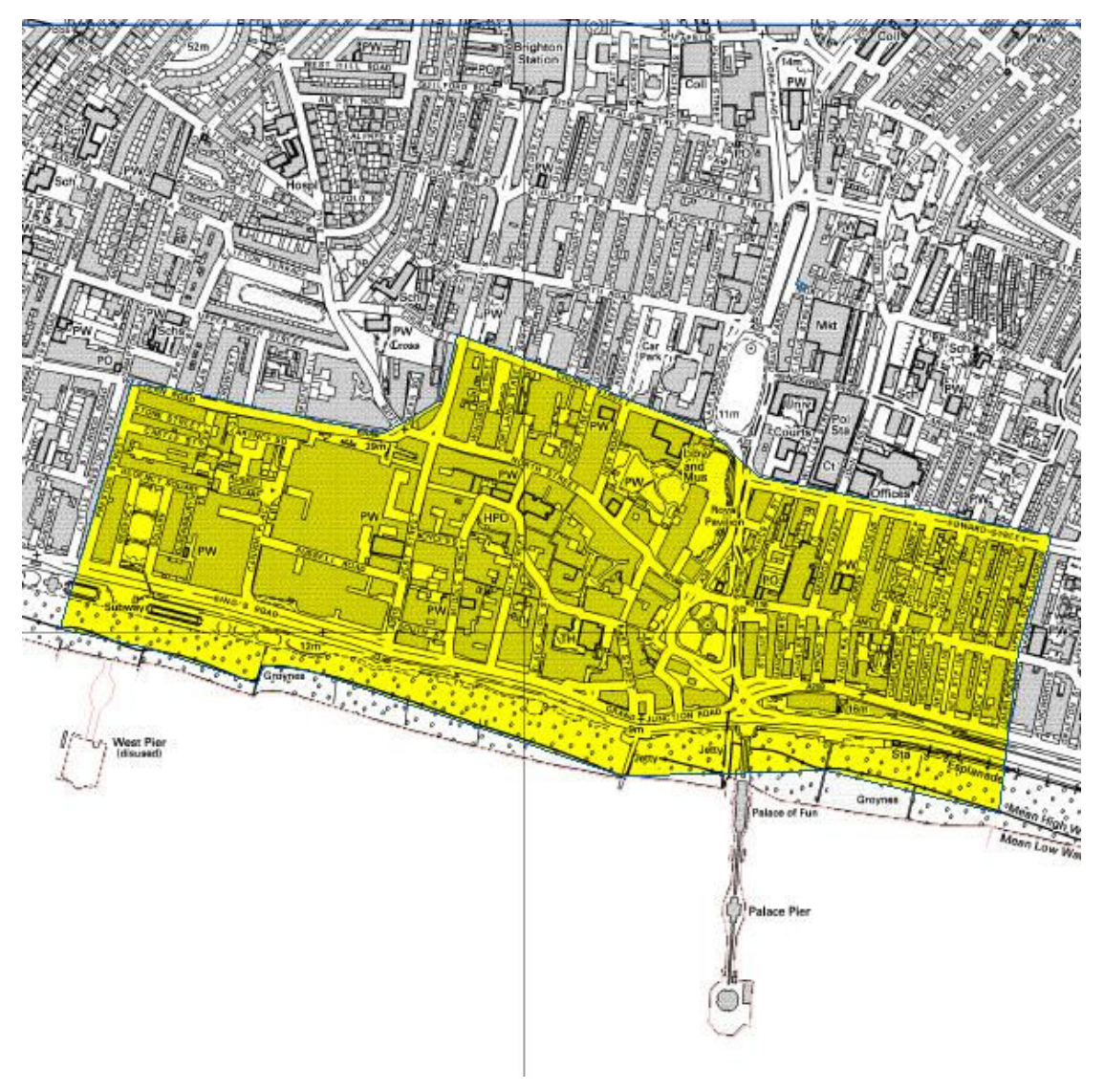
Brighton & Hove City Council - Cumulative Impact Area

The Cumulative Impact Area comprises the area bounded by and including: the north side of Western Road, Brighton from its intersection with the west side of Spring Street to the junction with the west side of Dyke Road at its eastern end; from there, northeast to the junction of the north side of Ayr Street with the west side of Queens Road and then northward to the north-west corner of Queens Road junction with Church Street; thence along the north side of Church Street eastwards to its junction with Marlborough Place and continuing south-east across to the north-western junction of Edward Street; along the north side of Edward Street to the east side of its junction with Egremont Place and southward along the eastern sides of Upper Rock Gardens and Rock Gardens; southward to the mean water mark and following the mean water line westward to a point due south of the west boundary of Preston Street; northward to that point and along the west side of Preston Street to its northwest boundary and then diagonally across Western Road to its intersection with the west side of Spring Street